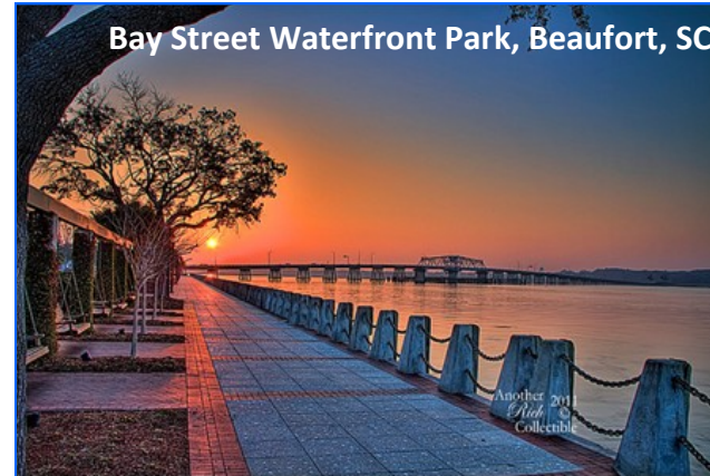
Bay Street Waterfront Park, Beaufort, SC