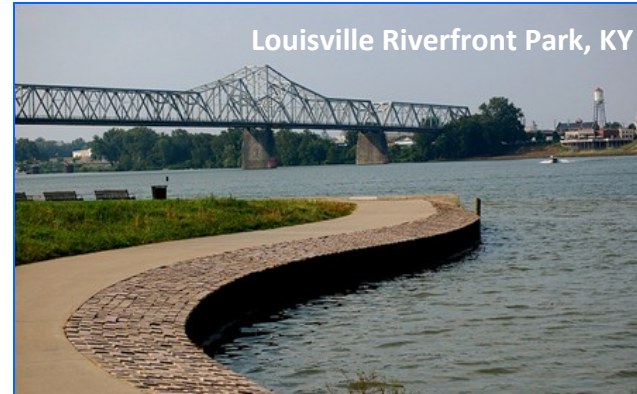
Louisville Riverfront Park, KY