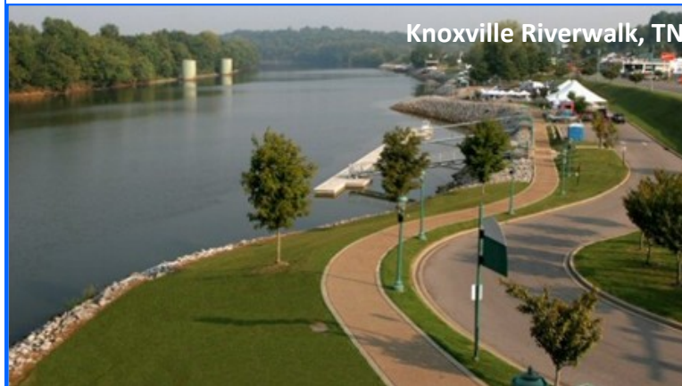
Knoxville Riverwalk, TN