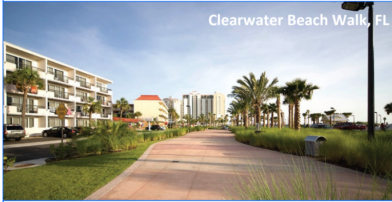
Clearwater Beach Walk, FL