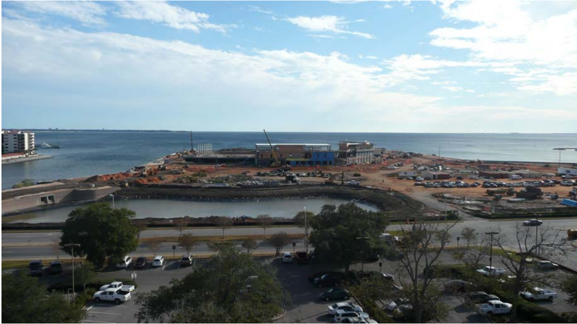
Project Under Construction

Construction of the stadium and related infrastructure was completed in March 2012. Construction of the amphitheater was concluded in June 2012 and the breakwater construction on the southwest corner of the property was completed in October 2015.