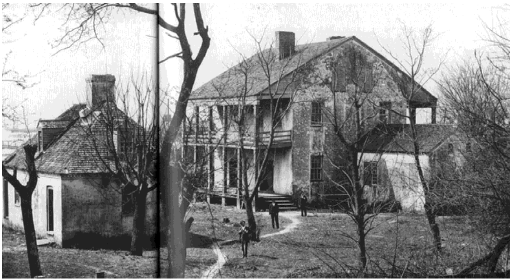
Panton-Leslie Trading Post, located on the Maritime Park property, circa 1850's

The Vince Whibbs, Sr. Community Maritime Park is a master planned, public/private, urban renewal project on a former industrial, 32-acre parcel located on Pensacola Bay, in Pensacola, Florida. The property, significant in the city's unequaled 450 years of history, was utilized as the Panton-Leslie trading post as early as 1784. The peninsula saw many expansions and changes in use as the Pensacola waterfront evolved. Last utilized in the 1980's as a petroleum depot and sea-to-rail transfer station, the site sat fallow for over 30 years. The City of Pensacola acquired the property to ensure a public use for the site. The Community Maritime Park project was approved by the Pensacola City Council in 2005 and affirmed, via referendum, in September 2006. Since that time, project professionals have designed, permitted and constructed the elements of the project.