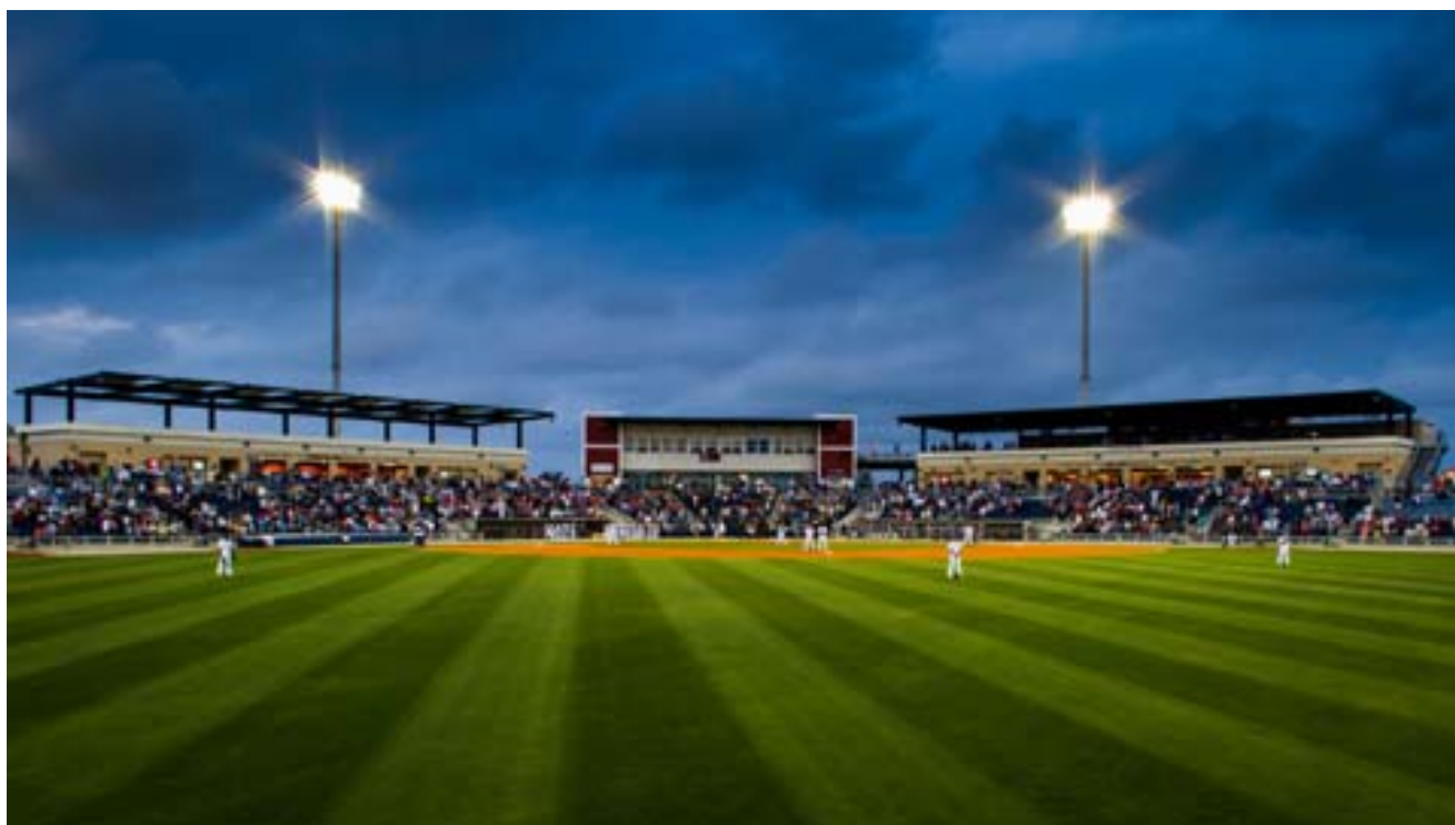
Pensacola Blue Wahoos Playing at the Maritime Park Stadium