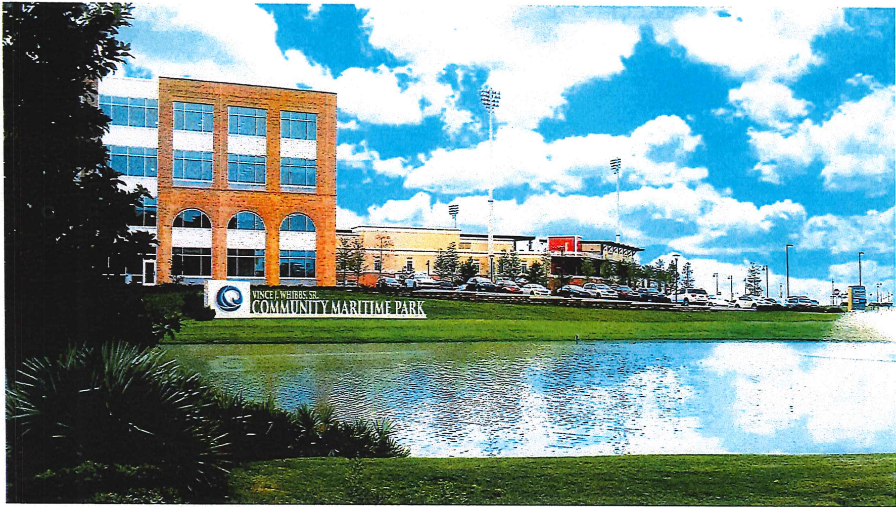
Community Maritime Park